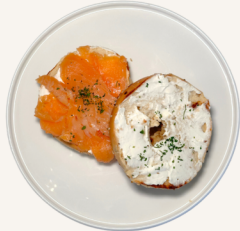
Lox Bagel Toasted everything bagel with smoked salmon and parsley 10.25