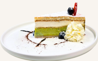
Pistachio Cheesecake Light balanced flavor with whip cream and seasonal fruits 8.5