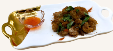
Baked Chicken Baked chicken bites with seasoning and basil 8