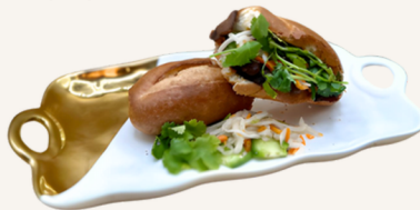
BBQ Pork/Chicken Banh Mi Korean BBQ with pickled vegetables, cilantro, and jalepeños 9