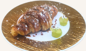
Croissant Choice of vegan or chocolate croissant topped with brown sugar 5