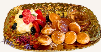
Mini Puff Pancakes Mini pancakes served with syrup and whip cream 6